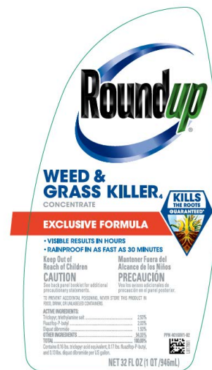
Image 1. Roundup-branded herbicide that does not contain glyphosate available to consumers in 2024.

While these changes will be reflected on product labels, consumers who have used Roundup-branded herbicides for many years may not immediately recognize these changes or understand the importance of reading and reviewing labels before use. Failure to follow label directions may undermine efficacy and increase the likelihood of off-target movement and associated risks.