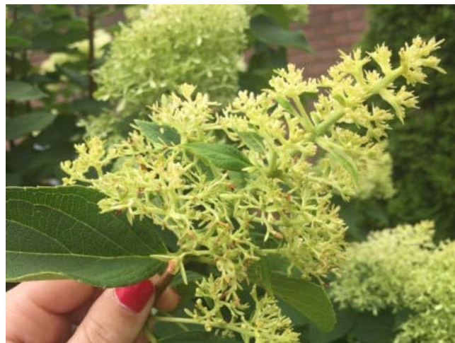
Image 4. Damage to Hydrangea paniculata bloom showing distorted flower formation from use of Roundup® Extended Control (glyphosate + imazapic + diquat) as an edge treatment for weed control in the landscape bed when the homeowner had thought they selected a glyphosate-only Roundup® product.