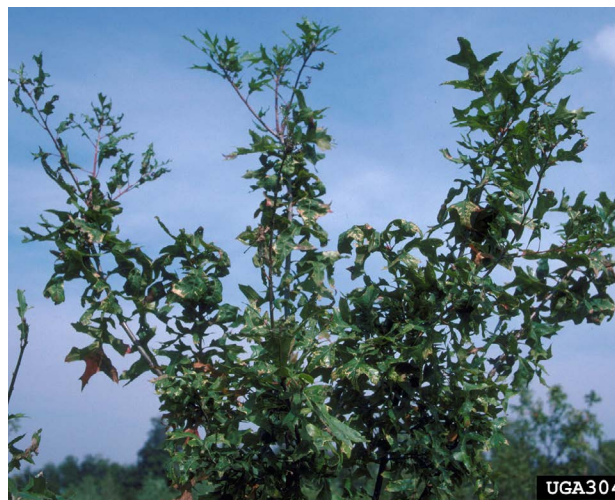
Image 3. Young oak tree ( Prunus spp. ) showing damage from nearby use of the herbicide triclopyr (WSSA #4).

Pelargonic acid is a non-selective herbicide used for broad-spectrum control of green vegetation including broadleaf and grassy weeds, as well as mosses. Pelargonic acid is a contact herbicide. It does not translocate and only burns treated tissue via an unknown mechanism (WSSA Group #0). Acute toxicity of pelargonic acid is low ( LD_{50} > 5000 mg/kg); however, it can be volatilized after application. Pelargonic acid is not persistent in soil .