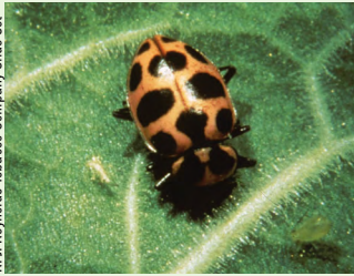
R. J. Reynolds Tobacco Company Slide Set