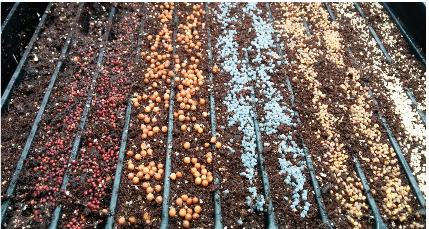
Figure 3. A range of microgreen crops seeded in a greenhouse tray that has divisions for easy seeding of multiple crops.

Also be aware that seed can be purchased as a single species or as pre-mixed microgreens selections. These pre-mixed packages may combine mild and/or spicy flavors as well as colors and textures to make deciding on crops and species more straightforward for the beginner. Purchase only as much seed as you will use in a few months and store it in a cool, dry location to prevent reduced germination and vigor.