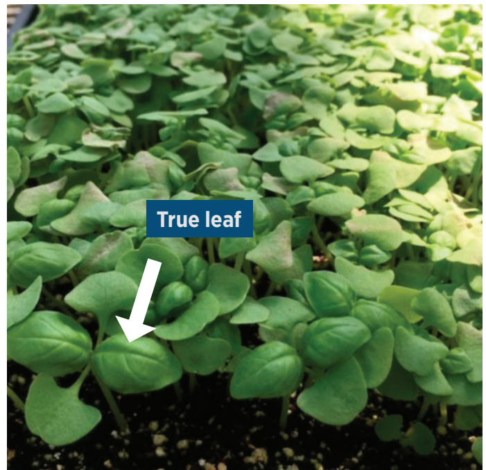
Figure 6. Basil microgreens at the true leaf stage after 25 days.

container may reduce watering frequency. Larger seeds are generally covered with 1/4 inch of substrate to prevent drying during germination (i.e., pea, beet, chard and sunflower). Small seeds — such as arugula, kale, broccoli, amaranth, chives and basil — are often simply seeded and then watered in. As long as the substrate is kept moist, they will germinate well without being covered.