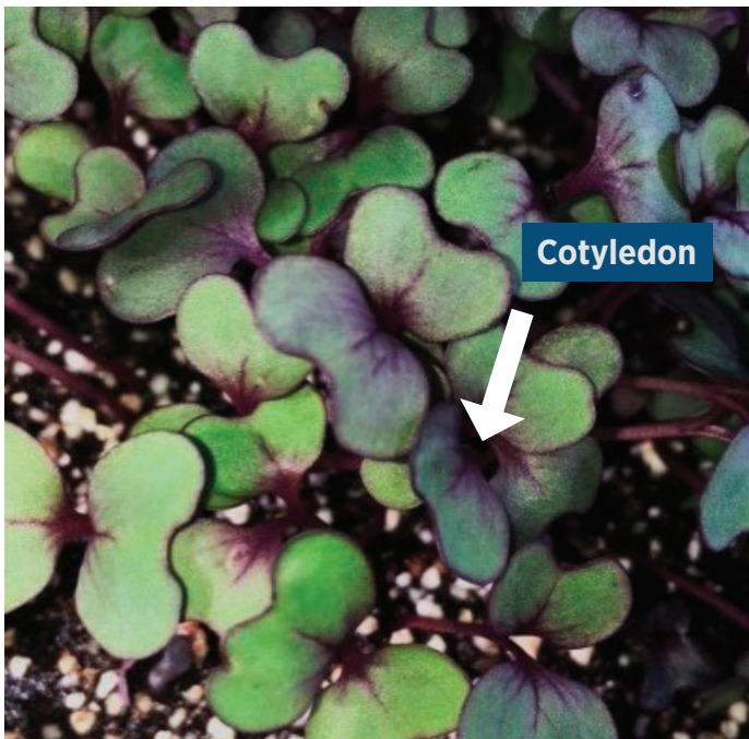
Figure 5. Red cabbage microgreens at the cotyledon stage after 16 days.