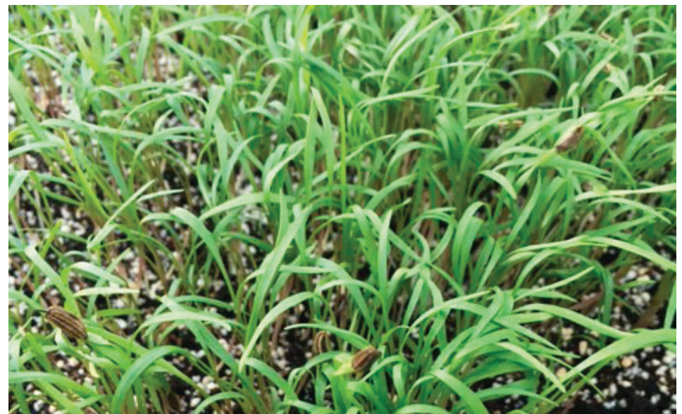
Figure 2. Fennel microgreens grown in soil in a shallow germination tray at 14 days.

• Ease of production — Due to differences in location and management practices, it is difficult to precisely list easy and challenging microgreen crops. Some of the cool-season crops in the Brassica family, such as broccoli, arugula, radish and pac choy, can be good crops to try initially due to their moderate light and temperature needs and relatively quick growth rate. Basil, cilantro, fennel, parsley and carrot tend to be slower germinating and/or growing, which can