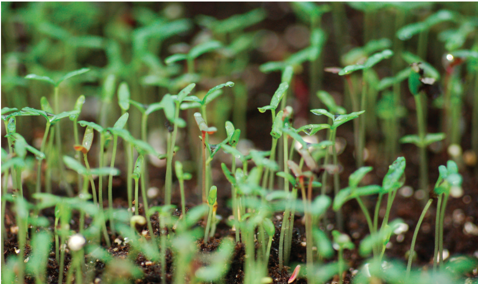
Figure 1a. Amaranth microgreens.