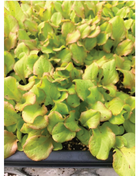
Figure 1b. Speckled loose-leaf lettuce microgreens.

to become familiar with these greens if they are new to your palate and diet. Studies have shown that these immature crops, when compared to mature vegetable crops, can contain higher concentrations of antioxidants and other phytonutrients potentially beneficial to human health.