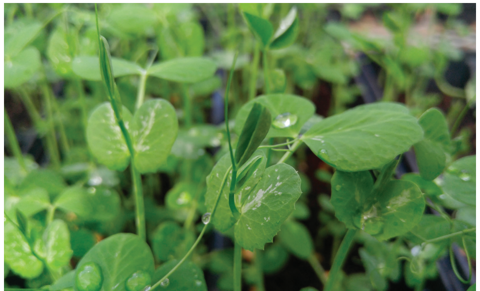
Figure 8. Pea microgreens ready for harvest.

Microgreens are used fresh and can be added whole or chopped into various dishes. Coarsely chopping herb microgreens helps to bring out their unique flavors and aroma. Microgreens should not be heated since they quickly deteriorate when cooked, although they can be added as garnish on top of hot dips or dishes. They can be used liberally in cold dishes like salads, smoothies and sandwiches. Microgreens are unique greens that can be used to enhance the visual appeal, texture, flavor and nutrition of snacks and meals at home.