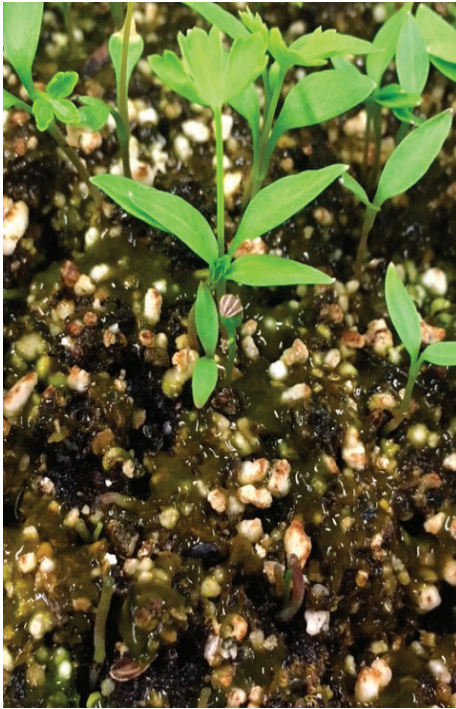
Figure 7. Algae growing on substrate around parsley microgreens.

seedling death are often linked to over seeding, over watering, poor airflow, low light levels and extreme temperatures. Algae growing around young plants can become a problem with microgreens that are slow growing, but it generally poses little threat to plants (Figure 7).