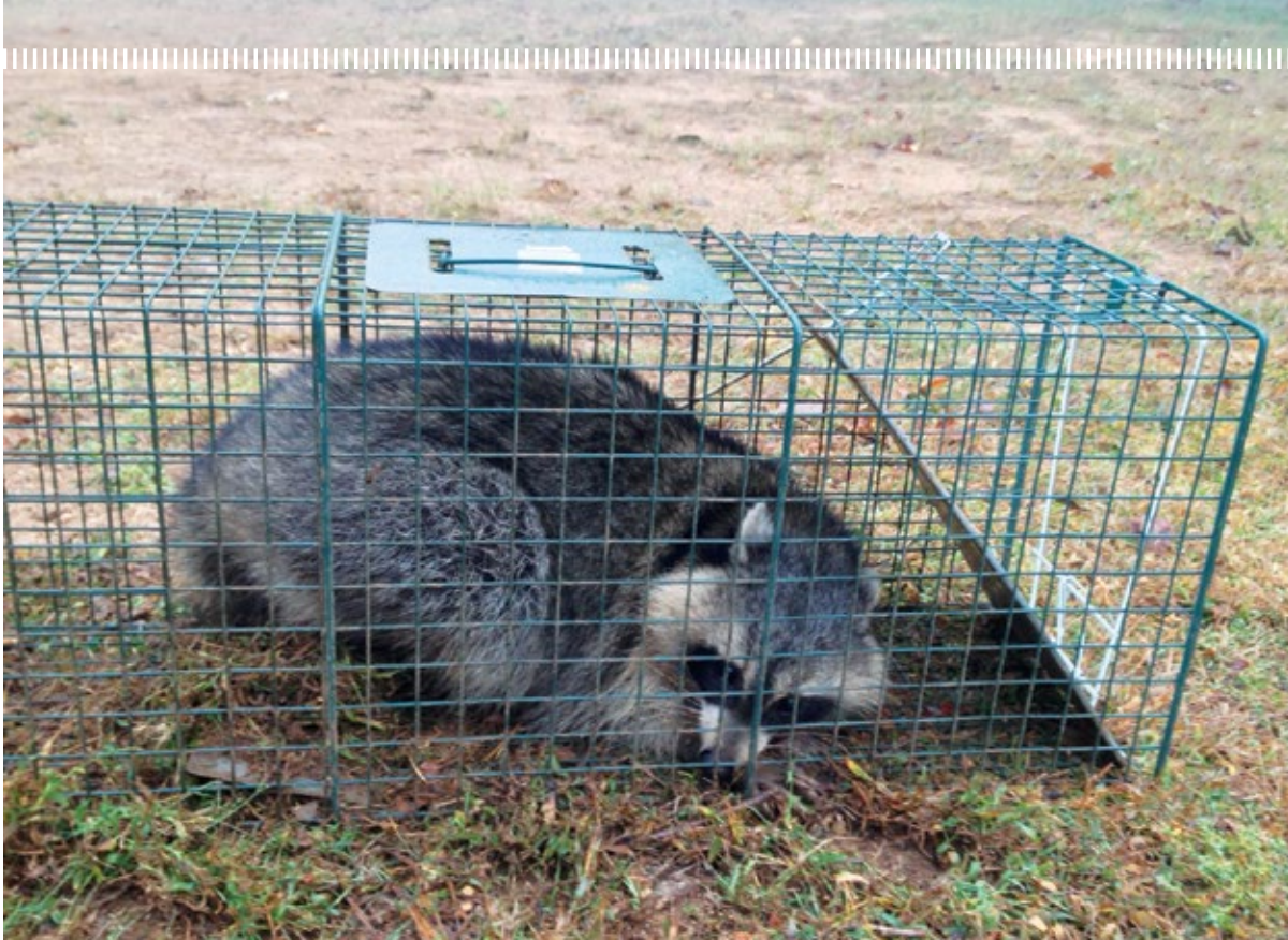
Live traps are very effective for some mammals, including opossums and raccoons.

trigger. For many rodents, snap-traps baited with peanut butter and bird seed is effective. For groundhogs (which are also rodents) and rabbits (which are not rodents), fresh vegetables are effective. For most carnivores and omnivores (such as raccoons, opossums, foxes, skunks, and cats), sardines, pet food, or raw chicken scraps are effective. Traps should be checked daily.