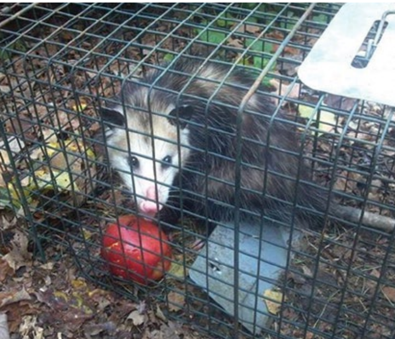
Opossums are omnivores. This one was attracted to a trap with apples.