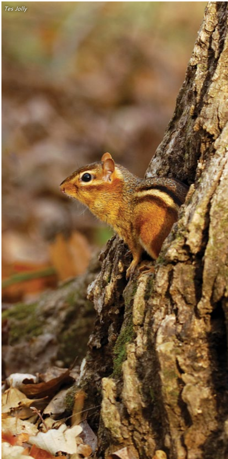
Chipmunks commonly dig burrows in shrubbery around homes, especially when adjacent to wooded areas.