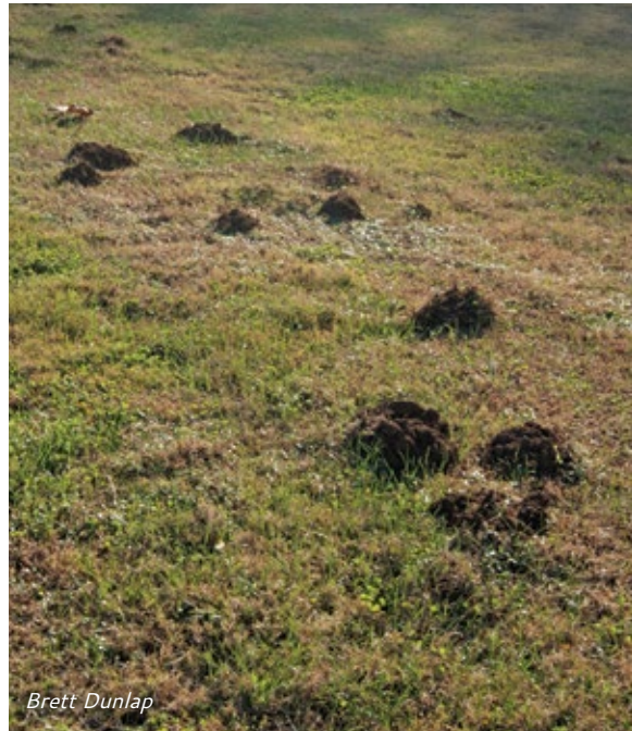
Brett Dunlap Mole hills represent soil pushed up by moles when digging their tunnels. However, there is no hole.

There are 3 types of mole traps: choker, pincher, and harpoon. All are set in a similar manner. To determine where to set traps, tamp down small sections (the width of your shoe) of several tunnels during the afternoon or early evening, then check the next morning to see which tunnels are raised—this is where traps should be set. Dig out a portion of the tunnel slightly larger than the trap, place the trap so the mole will travel through it, then replace the soil in the hole, packing it firmly where the trigger pan will rest. Do not, however, tear up large or