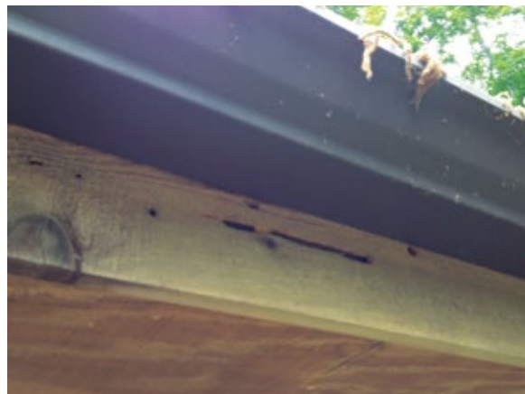
Woodpeckers frequently cause damage to homes by pecking on siding looking for insects. Here, a downy woodpecker has drilled out a section of a board where carpenter bees were nesting.

Most of the damage caused by armadillos results from rooting in gardens, landscape beds, and turfgrass areas. They dig small holes while searching for food and may burrow under structures. Armadillos can be caught in live traps by placing the traps in runways used by armadillos. Alongside buildings, adjacent to the wall, is a good place where armadillos may have