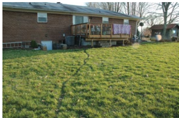
Making conditions unfavorable for nuisance wildlife usually solves the problem. Here, rats are attracted to pet food that was kept outside the house.