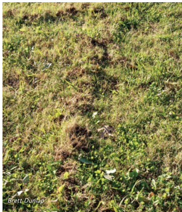
Brett Dunlap Mole activity is easily noticeable by raised surface tunnels in a yard.