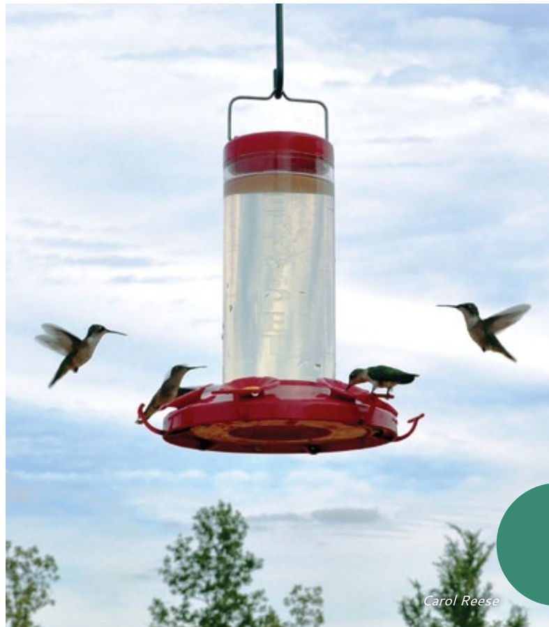
The wide chamber of this feeder allows you to insert your entire hand inside for cleaning, plus it includes several ports with perches, which allows several hummingbirds to feed at once.

Bees and wasps can be a problem on hummingbird feeders, and many of the better feeders take this problem into account. It is easily solved because the hummingbird’s tongue can reach much further than the proboscis of bees or wasps. Some feeders have bee guards that deny close access to the ports, and others are made so that the level of the fluid in the reservoir is too low for bees and wasps to reach, but is still easily accessed by hummingbirds.