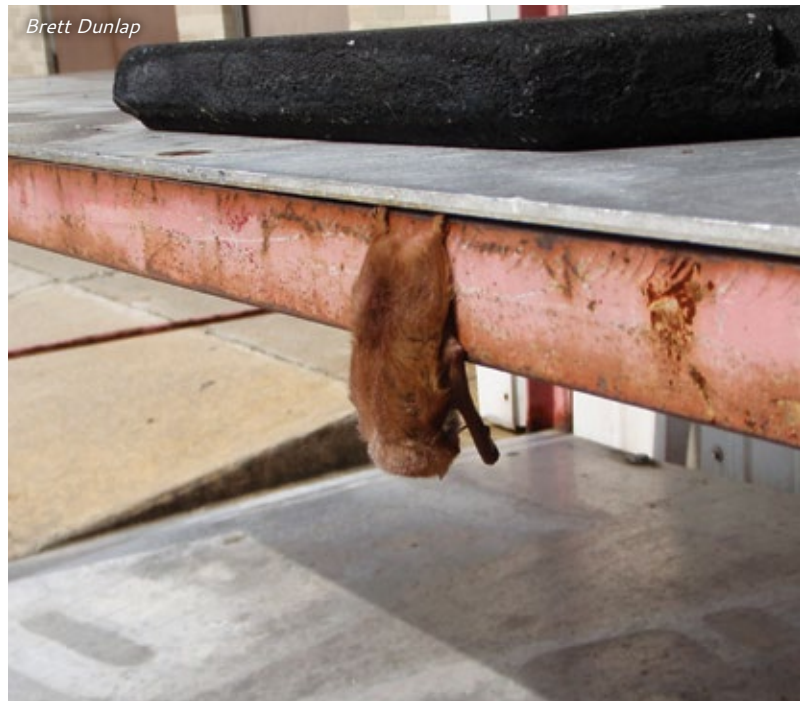
Roosting bats can be problematic in homes. Preventing access is key to controlling the problem.

Moles are small mammals that spend most of their lives in underground burrows. Three species of moles live in Tennessee. The eastern mole ( Scalopus aquaticus ) is found throughout the state. The hairy-tailed mole ( Parascalops breweri ) and the star-nosed mole ( Condylura cristata ) both are found only in extreme eastern Tennessee. Measuring 6–8 inches from tip of nose to tip of tail, they are similar in appearance to shrews and mice, and they may occupy the same area. The mole's most notable feature is the greatly enlarged paddle-like forefeet and prominent toenails that enable the mole to almost literally "swim" through the soil. Their legs are strong, their necks are short, and their heads are elongated. Their ears and eyes are so small that at first glance they appear to be missing. A mole's fur is soft and velvety. It ranges in color from black to brownish or grayish with silver highlights. When brushed, the fur offers