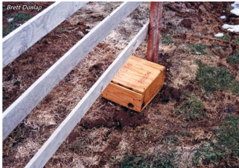
Toxic baits should be used in such a way that minimizes possible impact on nontarget animals. Here, a box with zinc phosphide bait has been placed in an area where vole damage was excessive.

Cardinals, mockingbirds, and a few other species commonly fly into windows or glass doors during spring and summer. Large picture windows and sliding glass doors are attacked most often. These birds establish territories that they defend during the reproductive season, so individual birds may continue to batter these windows each time it sees its reflection in the bright, shiny glass, apparently thinking the image is an intruder in its territory. Homeowners may be concerned that the bird will kill itself, or become perturbed at the droppings and occasional blood spots on the window. Birds fighting their reflections usually do not hit the window hard enough to cause themselves harm, but sometimes do.