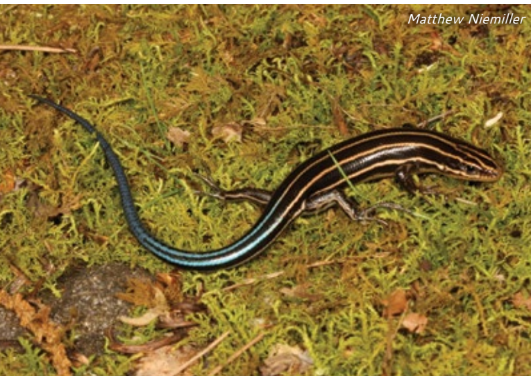
A juvenile broadhead skink has a bright blue tail, similar to a juvenile 5-lined skink.

Even though lizards native to Tennessee are harmless and beneficial, many people still want to remove them. Lizards are easily controlled and removed with glue boards. As with snakes, glue boards should be placed against walls and other structures where lizards commonly travel. Lizards can be safely released from glue boards by pouring vegetable oil over the lizards. Lizards are protected in Tennessee and indiscriminate killing is illegal. Permission from your county wildlife officer and a permit from TWRA are necessary to keep one in captivity.