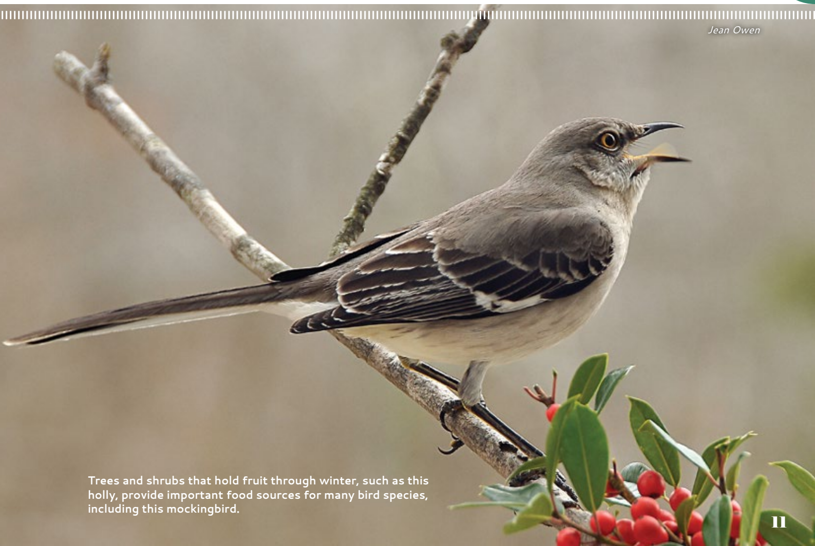
Trees and shrubs that hold fruit through winter, such as this holly, provide important food sources for many bird species, including this mockingbird.