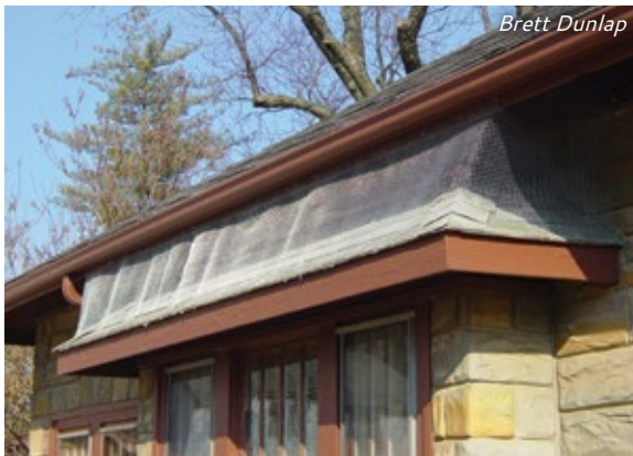
Top: Electric fences are effective for many needs, whether helping protect chickens or a garden from unwanted pests or predators.