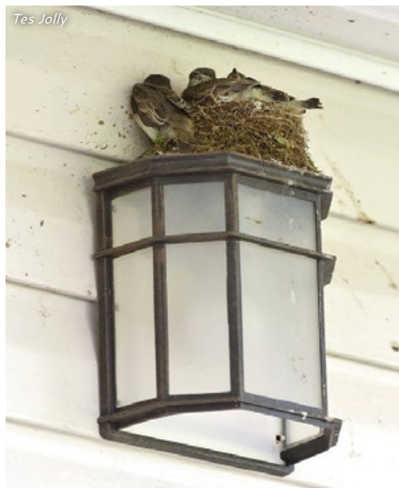
Birds can be a nuisance around homes, such as these phoebes nesting on the top of a porch light fixture.