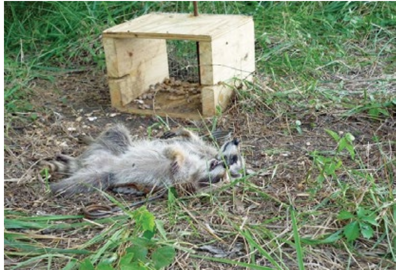
Conibear traps set in a homemade wooden box or even a plastic bucket work extremely well when baited to attract raccoons. This trap was baited with peanuts. Exercise caution in choosing sites and baits when setting such traps to avoid catching non-target animals, especially pets.

For rat and mouse prevention, protect the area with ¼-inch mesh hardware cloth or sheet metal. Store food in metal containers or in another way that makes it inaccessible. If feasible, remove the water source.