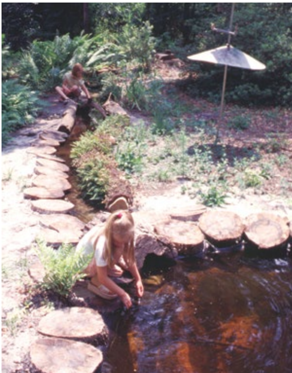
Backyards can be great places for children (and adults) to learn about natural resources.

To manage your backyard for wildlife, it is important to identify what you are interested in and what you hope to provide or see. Most people enjoy seeing species such as hummingbirds, bluebirds, and butterflies. However, you may enjoy watching red fox pups, woodpeckers, or even a raccoon. Regardless, you should consider which wildlife species you would like to see as well as your tolerance for other species. Next, you