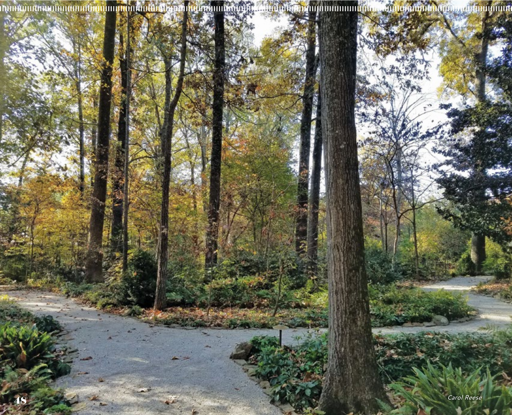
Example of a no-mow backyard.

and control others. The best application of control methods requires balancing the needs of yourself and other residents as well as the wildlife in the area. For homeowners and gardeners seeking to create attractive habitat for various wildlife species and solve nuisance wildlife issues, this information along with other supplemental resources and advice from UT Extension, TWRA, and USDA-Wildlife Services professionals should help in managing wildlife to create an enjoyable and sustainable residential area.