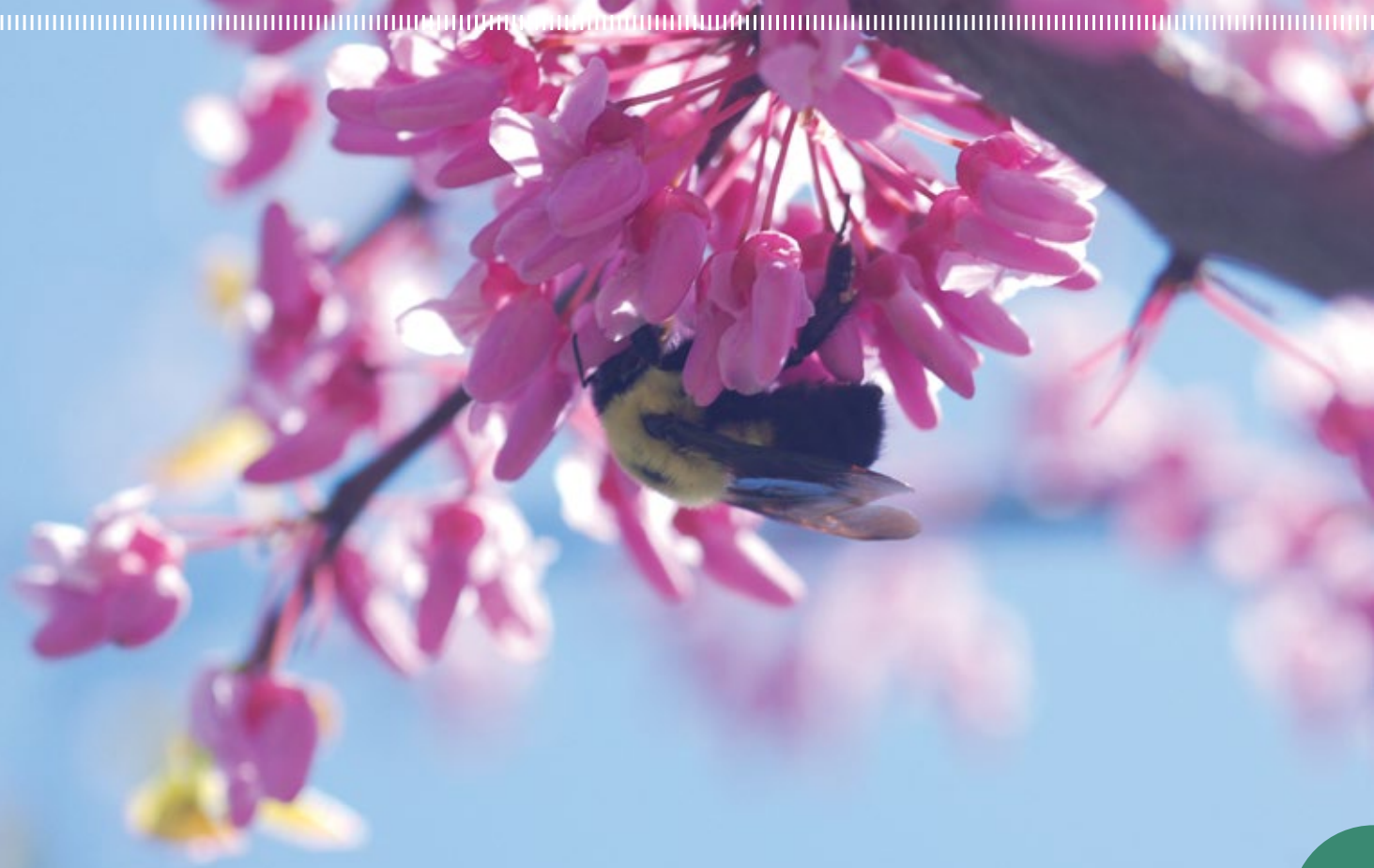
Several trees and shrubs, such as eastern redbud, can be important sources of nectar for pollinators. Natalie Bumgarner

Although it is not common to consider trees when planning a butterfly garden, they should be considered because a surprising number of butterflies rely on them for food and reproduction (see Table 1 for various species that may serve as larval hosts). Many shrubs and trees provide nectar for butterflies. Some may bloom seasonally, whereas others bloom for months. Shrubs and trees also provide shelter from wind and rain, as well as sunning and roosting sites. Some shrubs and trees are important host plants for the caterpillars. Trees should be located in appropriate spots so they do not shade out sunny areas of a butterfly garden.