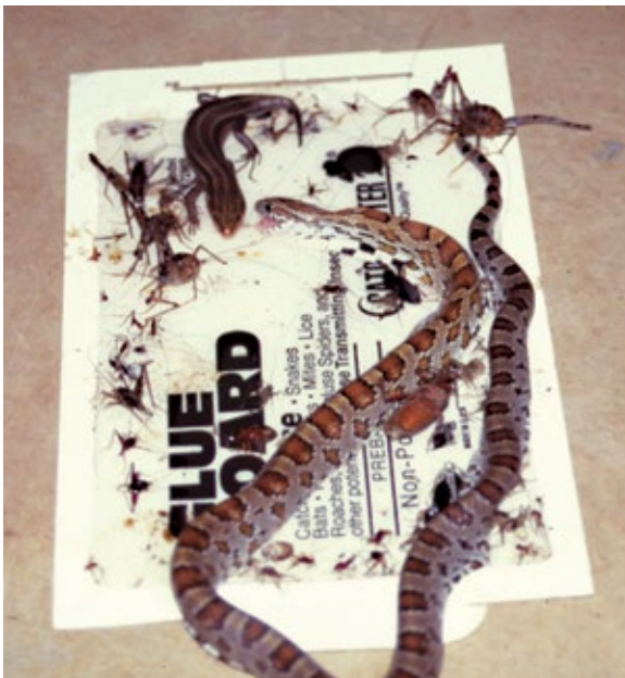
Above: Glue boards are very effective at catching “critters” in the house. Beneficial animals, such as this corn snake, can be released unharmed by pouring vegetable oil over the animal, which helps dissolve the glue and releases the trapped animal.

Glue boards are effective for trapping and removing small- to medium-sized snakes. Vegetable oil is used to dissolve the glue and release the snake unharmed once the snake has been relocated. Snake repellants are not effective. Exclusion is the most important step in avoiding problems with snakes in homes or other buildings. All openings into buildings ¼-inch or larger should be sealed by some means, such as boards, mortar, steel wool, sheet metal, or hardware cloth.