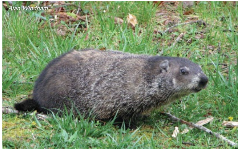
Shooting is the most popular technique to control groundhogs.