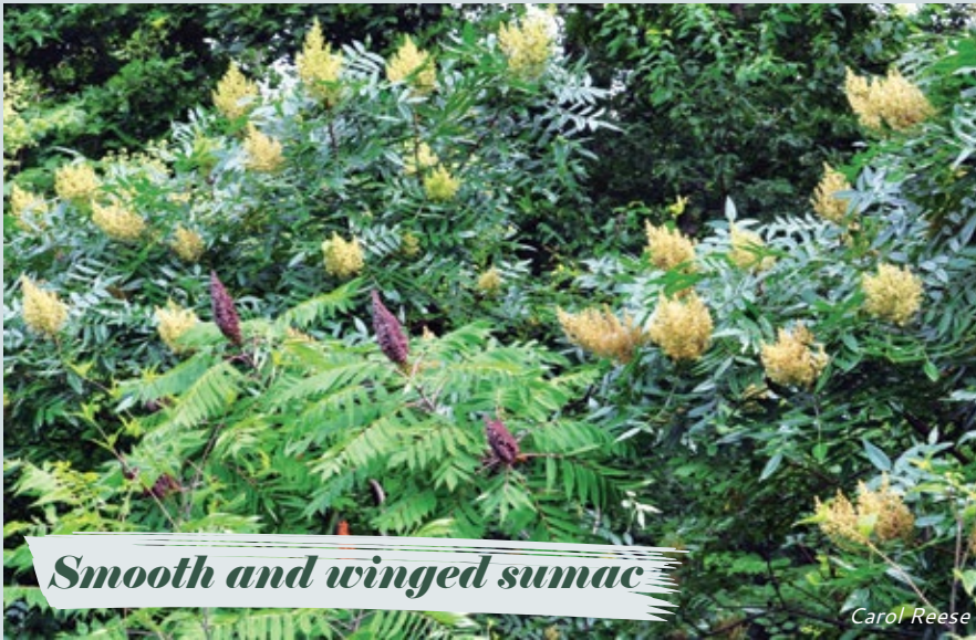
Smooth and winged sumac