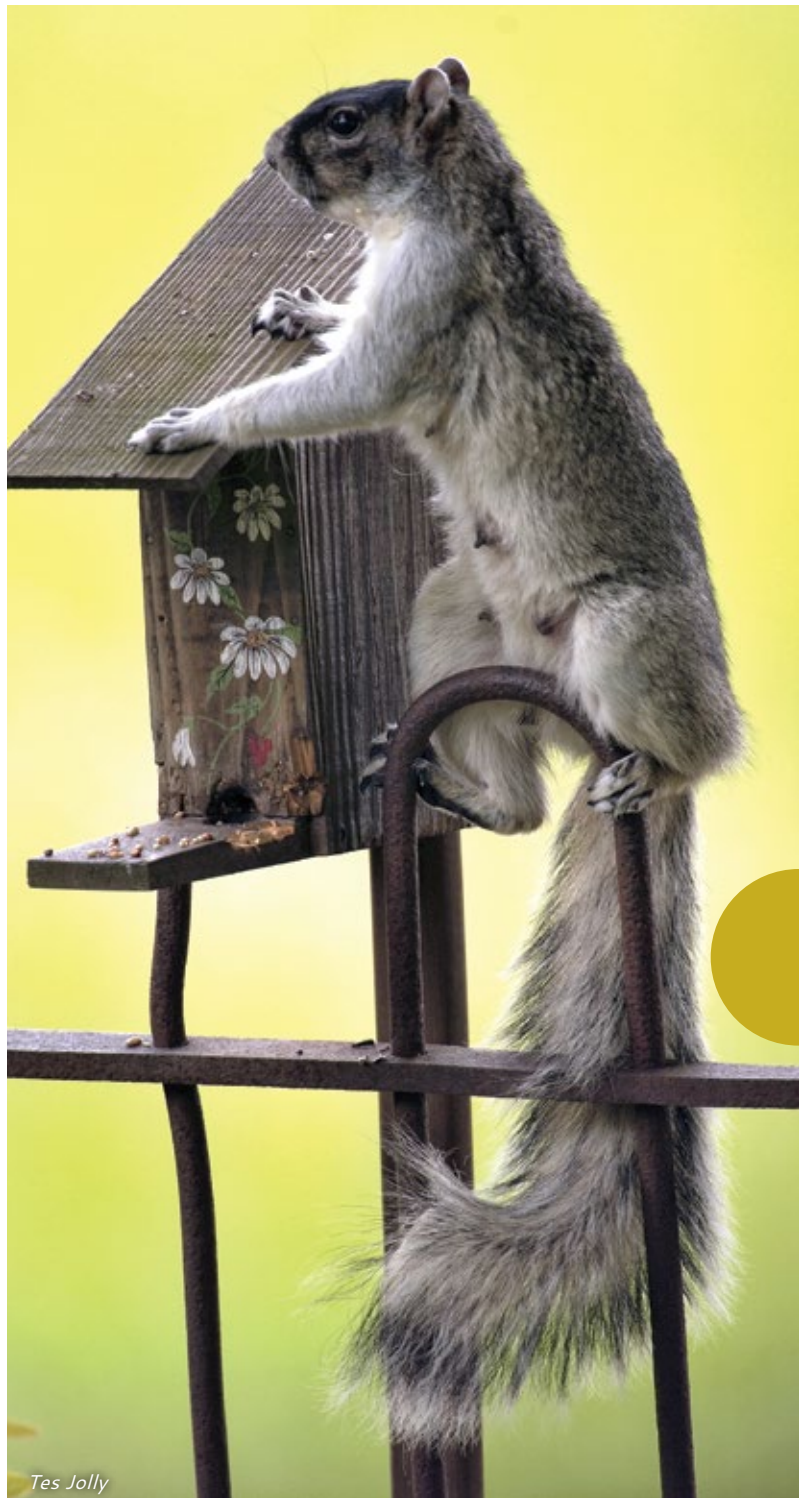
Squirrels can dominate bird feeders and consume or waste a lot of bird seed by knocking it out or off the feeder onto the ground where most of it germinates or becomes moldy. Both gray squirrels and fox squirrels (above) can be problematic.

Exclusion is the best defense against chipmunks around your home. Heavy-duty hardware cloth with ¼-inch mesh, caulking, mortar, or additional boarding should be used to close access areas. Flower gardens can be protected by covering the seedbed with hardware cloth, then placing a layer of soil on top. Areas of woody vegetation or other groundcover that connect shrubbery around your home with an adjacent woodlot provide chipmunks a ready-made travel corridor. Woodpiles and groundcover can hide burrow entrances, making them difficult to detect.