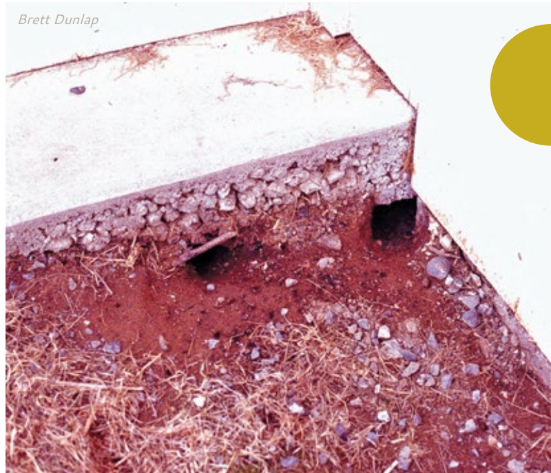
Rats dig burrows that lead to dens under structures.